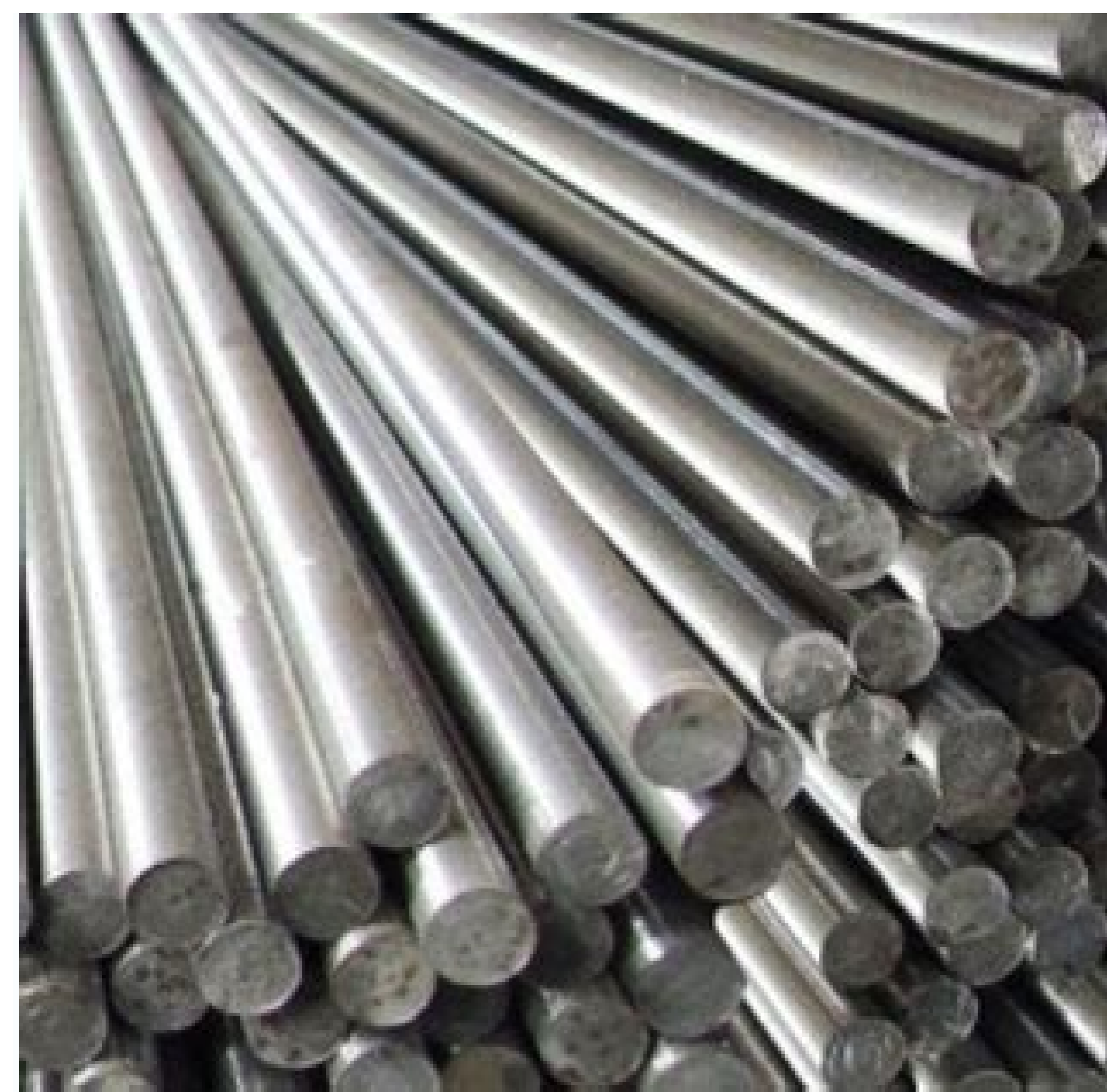
Astm steel standards pdf. Astm standards for steel toe boots. Astm carbon steel standards. Astm steel pipe standards. Astm steel toe standards. Astm stainless steel standards. Astm standards for steel free download pdf. Astm standards for structural steel fabrication.